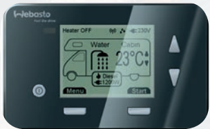
Digital control panel