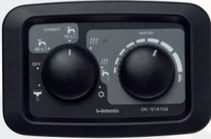
Manual control panel